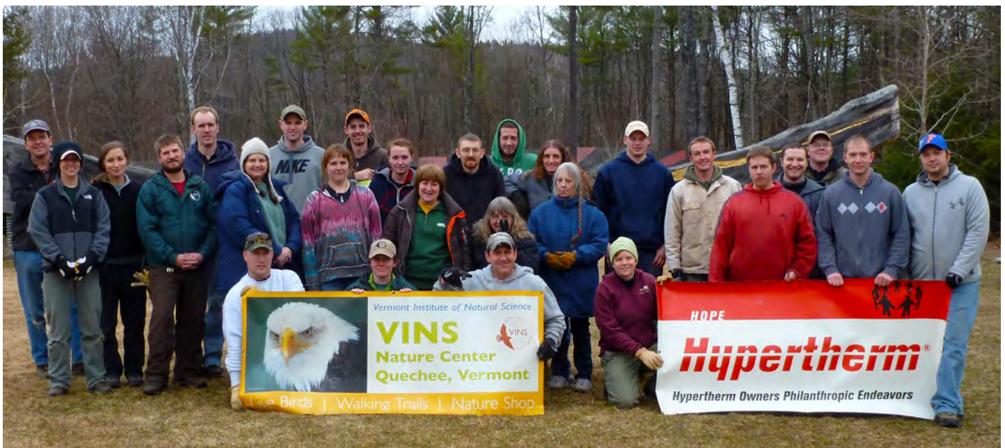
Hypertherm Nature Center Fall Clean-up Day Crew