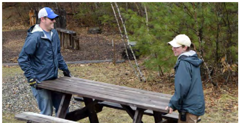
Hypertherm Nature Center Fall Clean-up Day Crew