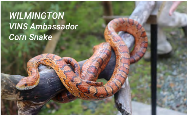
WILMINGTON VINS Ambassador Corn Snake