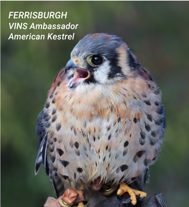
FERRISBURGH VINS Ambassador American Kestrel