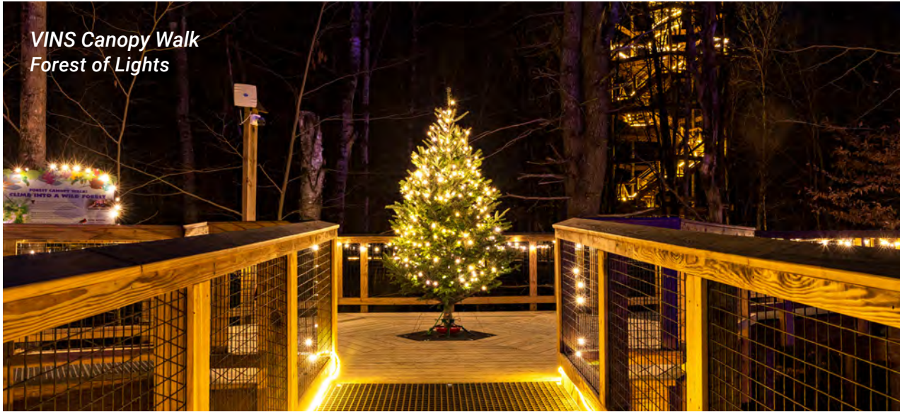
VINS Canopy Walk Forest of Lights