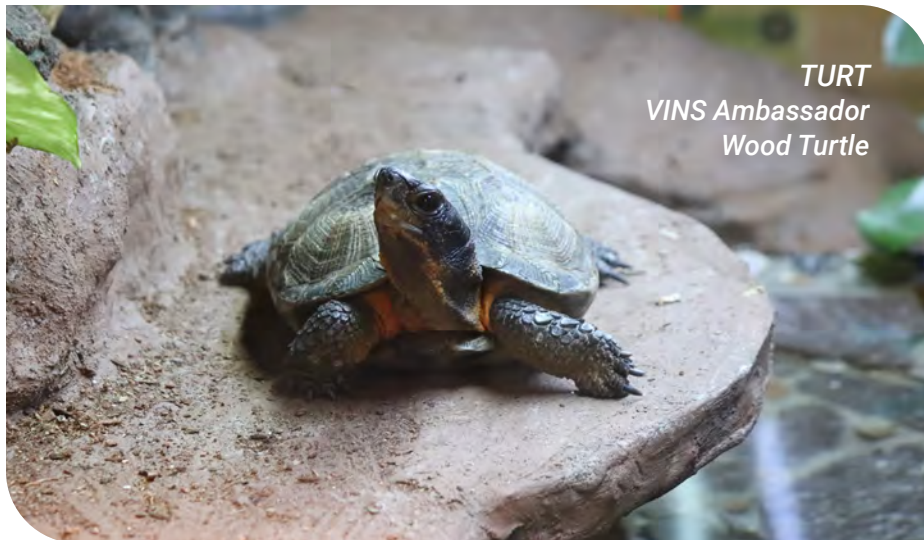
TURT VINS Ambassador Wood Turtle